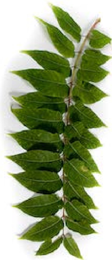
Ailanthus altissima "Tree of Heaven"

With the completion of the transcontinental railroad in 1869, California had a huge unemployed Chinese population. In 1860, Yolo County had a Chinese population of six individuals. By 1870, this number grew to 395. It is estimated that 70 Chinese lived within Woodland's city limits in 1870. These men worked as cooks in private homes and restaurants or as gardeners, laborers, and laundrymen. In the 1880 census, there were 100 Chinese living in and around Woodland including five women. Other sources say that the alley was home to around 250 Chinese.