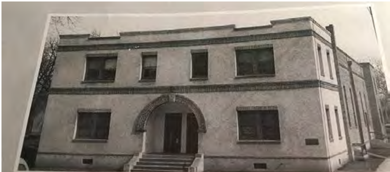
Holy Rosary Parish Hall, used as Church from 1943-1949

The decreasing number of nuns resulted in the loss of both of the parish's orders. The Sisters of Saint Francis of the Atonement left in 1966 after 21 years of service and the Sisters of the Holy Cross departed in the early summer of 1977, resulting in an all-lay faculty for Holy Rosary School.