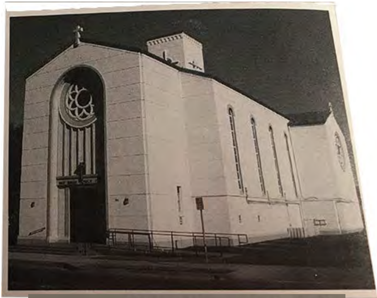
Holy Rosary Church, dedicated on October 2, 1949