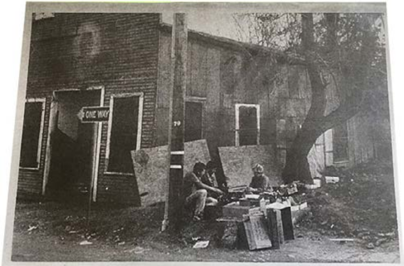
Last building in China Town

Chinatown on China alley was a thriving subculture in Woodland. Here on their free days, the Chinese could find the comforts of a common language and common customs. They could play dominoes or mahjong, gamble, visit the Chinese doctors, or just visit with their friends. We only have a few remnants left of the original Chinatown, but we do have them and the history they brought to the town and the county.