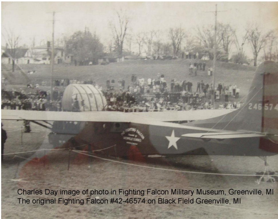
of photo in Fighting Falcon Military Museum, Greenville, MI The original Fighting Falcon #42-46574 on Black Field Greenville, MI